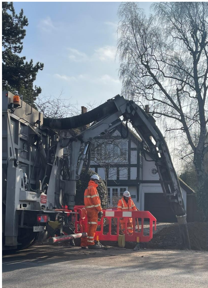
*Picture shows use of vacuum excavator for excavation of existing pavements.

While works are being carried out, the bus stop in this area is not operational – alternative bus stops are located opposite Downham’s Lane or opposite Ascham Road.